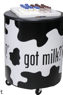
Got Milk 2-Crate Merchandising Cart 30084320