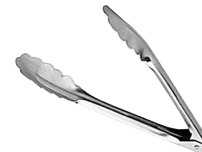
Utility Tongs 55073180