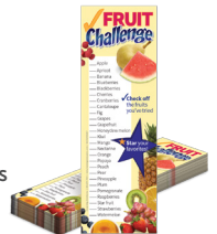
Fruit & Veggie Challenge Bookmarks 30084037