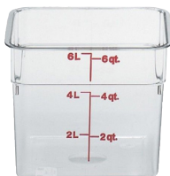
Food Storage Container 6 Qt. 55073108