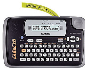
Label Maker 30084210