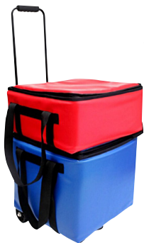
Breakfast in the Classroom Set 30084130

Here are just some of the great items to enhance your meal programs using Cool School Points.