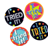
I Tried It Stickers 30082542