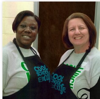
Terrebonne Parish School District, LA