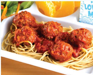
68197 Beef Meatballs with Mushrooms