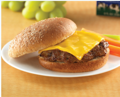
3842 Smart Picks® Flame Grilled Beef Pattie with Low Sodium

We offer menu items that are high quality, nutritious, and most importantly, deliver the taste kids love!