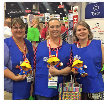
School Nutrition Association National Conference Registration (ANC) 30082316