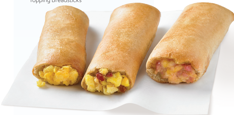
10205-1120 WG Cheese & Turkey Ham Breadsticks