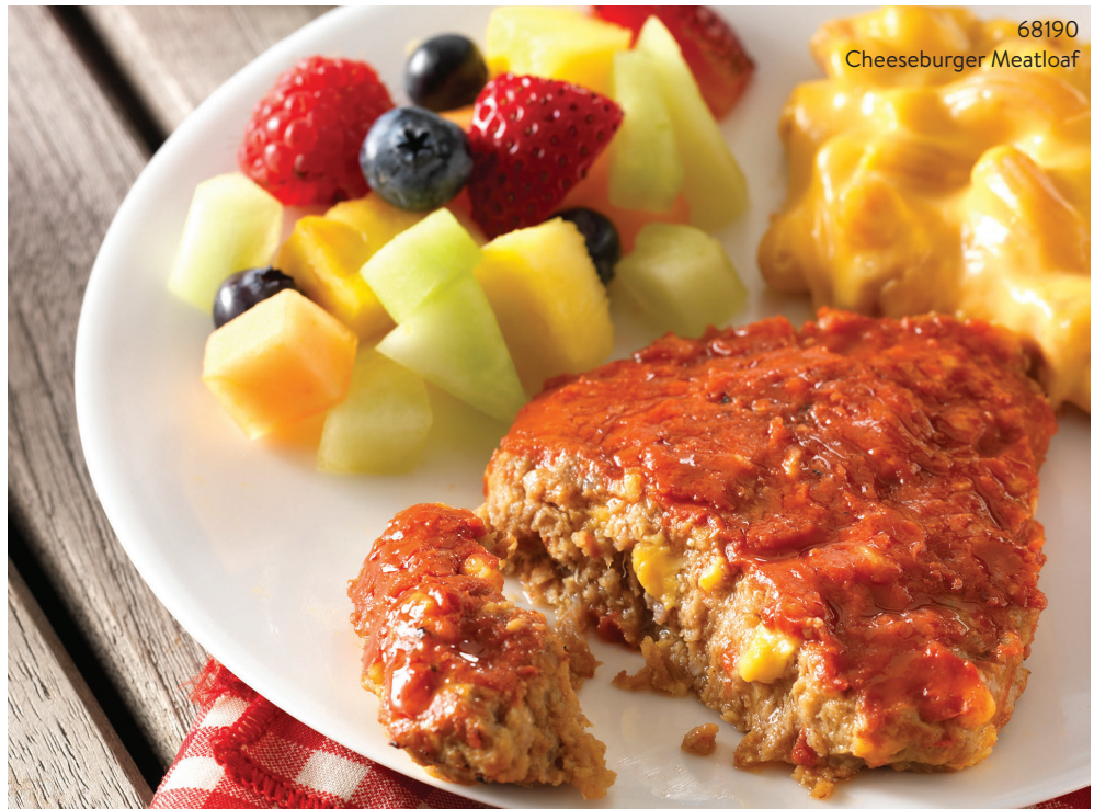
68190 Cheeseburger Meatloaf