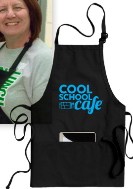
Cool School Cafe Apron 30082453