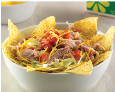
68168 Precooked Boneless Pulled Seasoned Pork