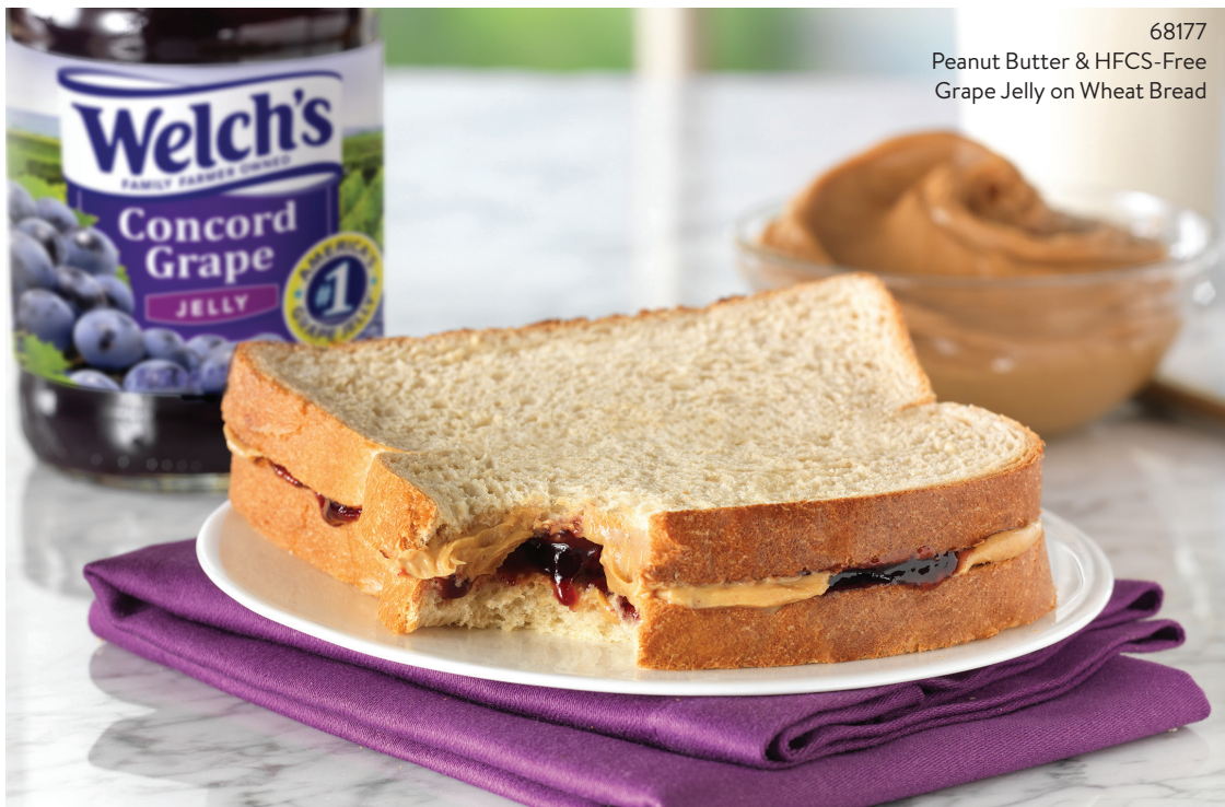
68177 Peanut Butter & HFCS-Free Grape Jelly on Wheat Bread