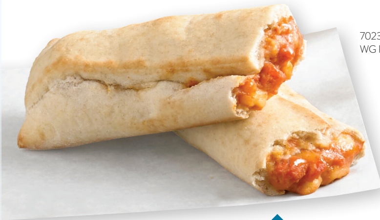
702372-1120 WG Pepperoni Pizza Stick