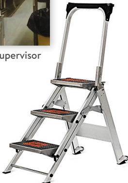
3-Step Little Jumbo Step Ladder 55074100