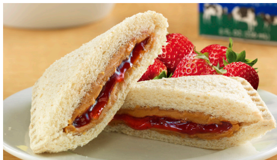
92127 Peanut Butter & HFCS-Free Strawberry Jam on Whole Grain Bread