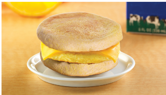
68243 Egg & Cheese on a Whole Grain English Muffin