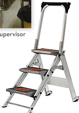
3-Step Little Jumbo Step Ladder 55074100