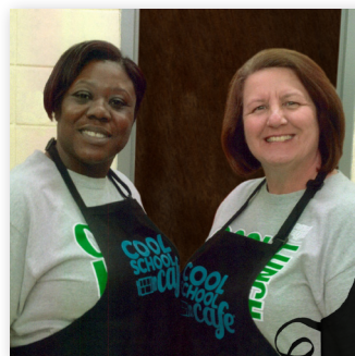
Terrebonne Parish School District, LA