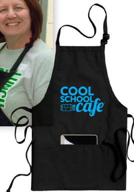
Cool School Cafe Apron 30082453