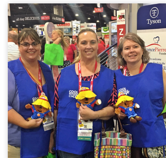
School Nutrition Association National Conference Registration (ANC) 30082316