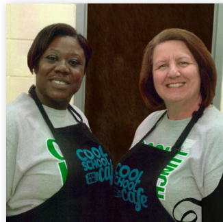
Terrebonne Parish School District, LA